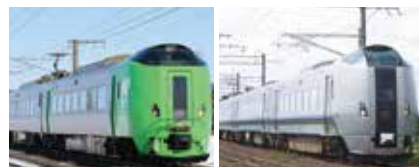
Ltd. Exp. Lilac

The Ltd. Exp. Kamui/Ltd. Exp. Lilac connects Sapporo and Asahikawa in just 1 hour and 25 minutes, and you can transfer to the Furano-Biei Norokko train. The model courses C and D on the back utilize the Ltd. Exp. Kamui/Ltd. Exp. Lilac train. There are many non-reserved seats, and is quite convenient for those who use the Furano Biei Rail Ticket.