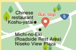
Michi-no-Eki (Roadside Rest Area) Niseko View Plaza