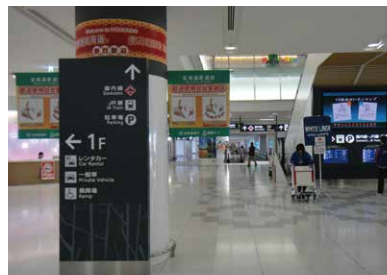
1 International Flight Terminal Arrives at the Arrival Lobby on 2F.

After you arrive at the New Chitose Airport International Terminal, access by train to Sapporo is the most convenient. The "Rapid Airport Train" runs every 15 minutes between New Chitose Airport and Sapporo Station. The duration is 37 minutes. Confirm route from the International Terminal to JR New Chitose Station on the map below.