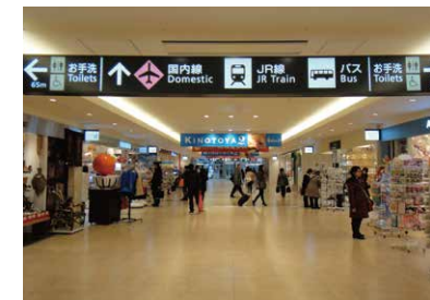
3 Domestic Terminal Proceed straight through.