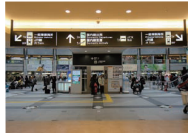
4 You will see the Domestic Terminal Elevator after you pass the souvenir shops.