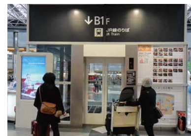
5 Get on the Elevator in the Domestic Terminal and go to B1F.