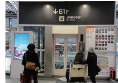
5 Get on the Elevator in the Domestic Terminal and go to B1F.