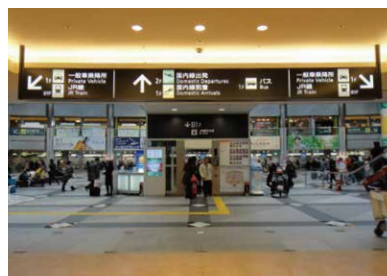
4 You will see the Domestic Terminal Elevator after you pass the souvenir shops.