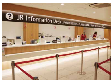
7 JR Information Desk Exchange rail passes and purchase JR tickets here.