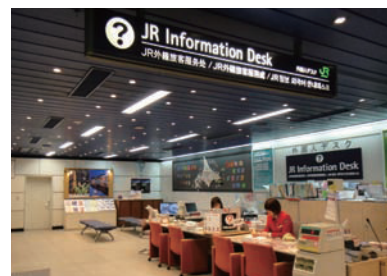
7 JR Information Desk Exchange rail passes and purchase JR tickets here.