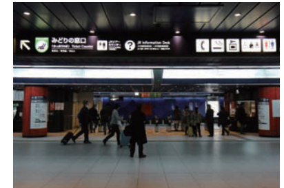
6 The Jr Information Desk is located to the left of the elevator on B1F.