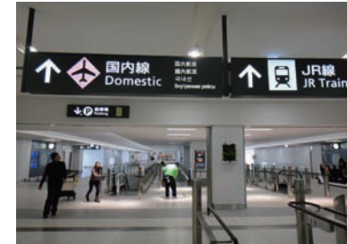
2 Head down the 240 meter long Connecting Walkway to the Domestic Terminal.