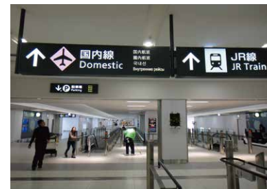
2 Head down the 240 meter long Connecting Walkway to the Domestic Terminal.