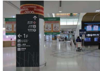
1 International Flight Terminal Arrives at the Arrival Lobby on 2F.

After you arrive at the New Chitose Airport International Terminal, access by train to Sapporo is the most convenient. The "Rapid Airport Liner" runs every 15 mins. between New Chitose Airport and Sapporo Station. The duration is 37 mins. Confirm route from the International Terminal to JR New Chitose Station on the map below.