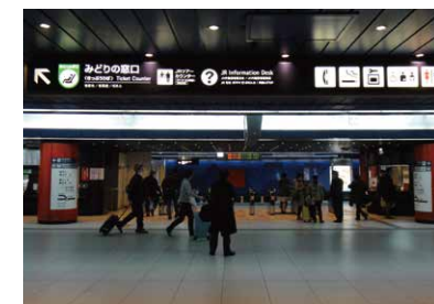
6 The JR Information Desk is located to the right of the elevator on B1F.