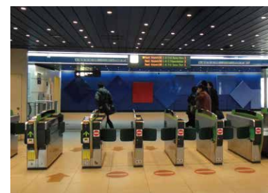
8 JR New Chitose Airport Station Ticket Gate Platforms are on B2F.