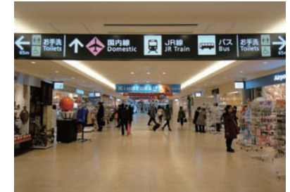
3 Domestic Terminal Proceed straight through.