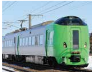
Ltd. Exp. Lilac

"Ltd. Exp. Kamui and Ltd. Exp. Lilac" have many non-reserved seats and you can transfer to "Rapid Furano Biei Train" or "Furano Biei Norokko Train" which is convenient for going to Furano area.