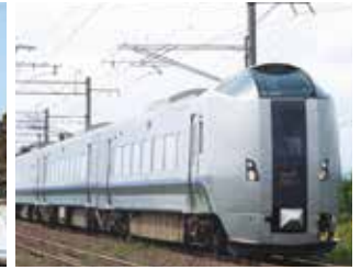
Ltd. Exp. Kamui

Operating every day between Asahikawa, Biei, Lavender-Farm and Furano during limited period!