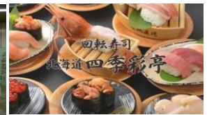
Kaiten-Sushi Hokkaido Shikisai-tei