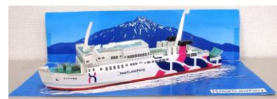
(Paper Craft Ferry Boat)

※Please purchase your ticket on cash or with credit card.